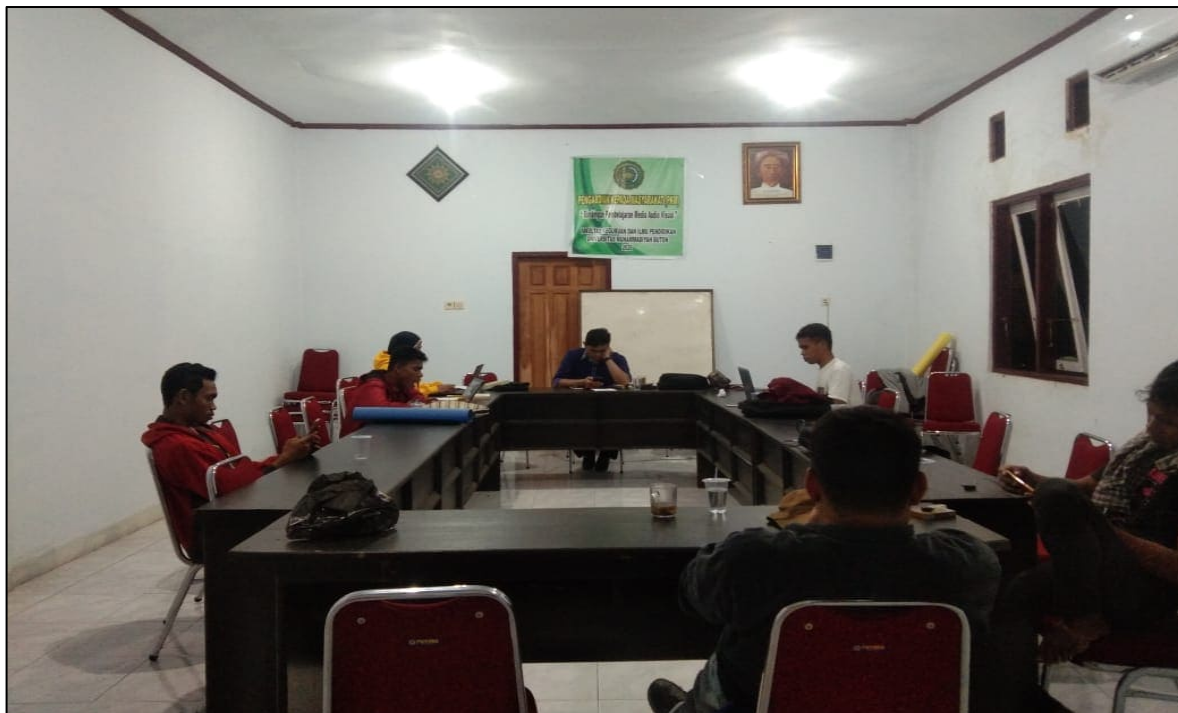
Figure 4. Second Meeting of Wondershare Filmora software practice

information technology, so if we do not follow this influence, we will be left behind and everything will quickly become obsolete, and left behind.