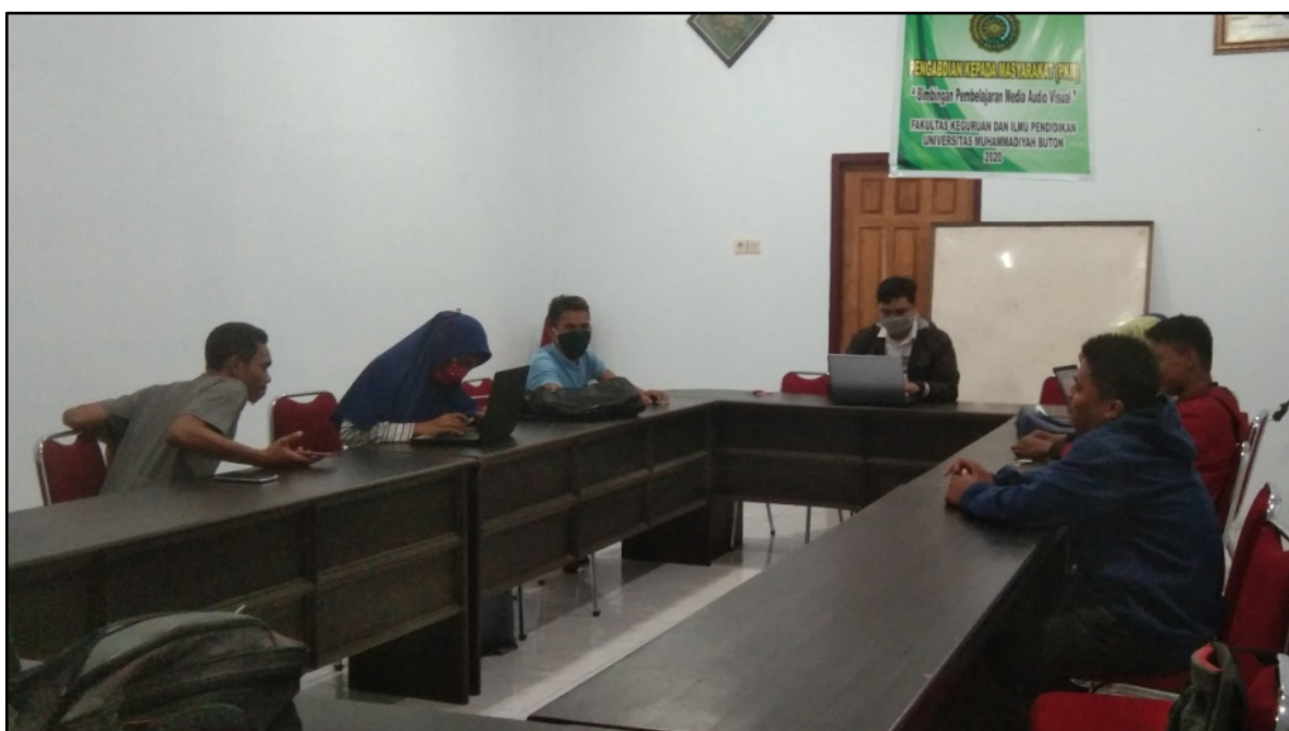
Figure 3. First meeting discussing Wondershare Filmora software

Audio Visual Media Learning Guidance using Wondershare Filmora software as Elementary School Teacher Professional Development in Murhum District, Baubau City". Based on the observations of the service team that until now in cluster 2 SD Batupoaro Subdistrict have not used Wondershare Filmora software as a learning medium in cluster 2 throughout Batupoaro District. Based on the foregoing, this service program aims to help increase the role of the Teacher Working Group Empowerment Team (KKG) Cluster 2 Batupoaro Baubau City in increasing the resources around them, improving learning media skills in accordance with the industrial 4.0 era as a whole. a) efforts that can increase the use of audio-visual media for teachers (b) efforts that can increase learning creativity in the professional development of elementary school teachers in Batupoaro District, Baubau City.