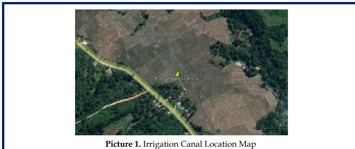
Picture 1. Irrigation Canal Location Map