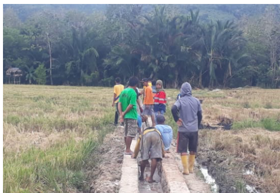
Picture 3. Assistance in Building Irrigation Canals