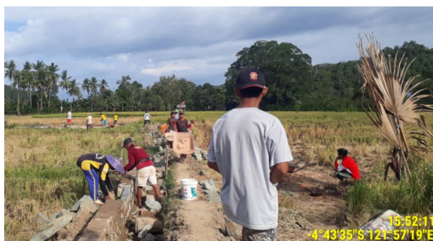
Picture 4. Irrigation channel works